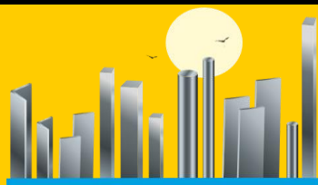
M.S.Angle, M.S.Flat, M.S.Square, M.S.Rounds, M.S.Sections MS Billets